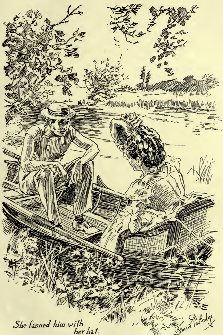
She fanned him with her hat.